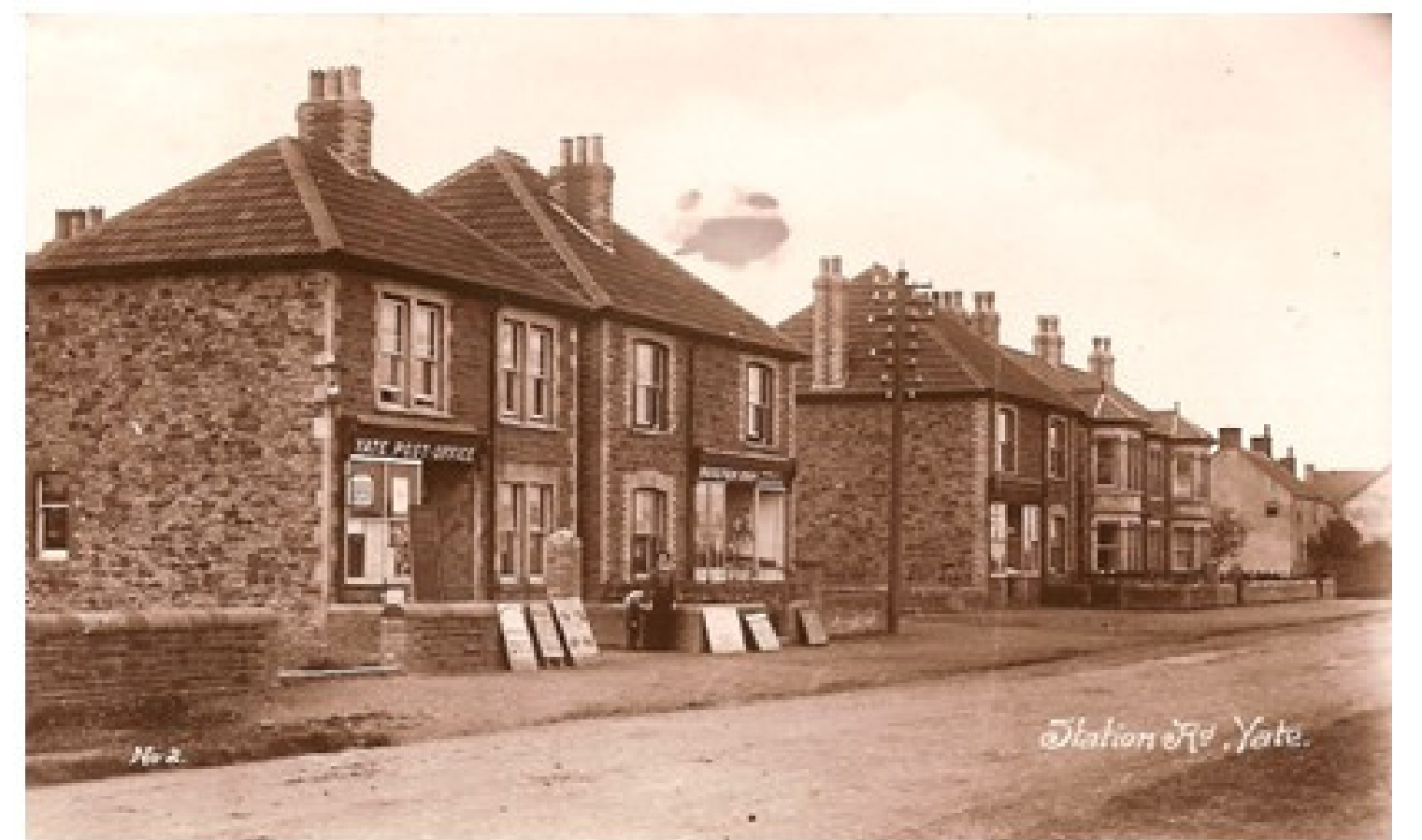
Yate Post Office and No.90 approx. 1925 (YDOHP)