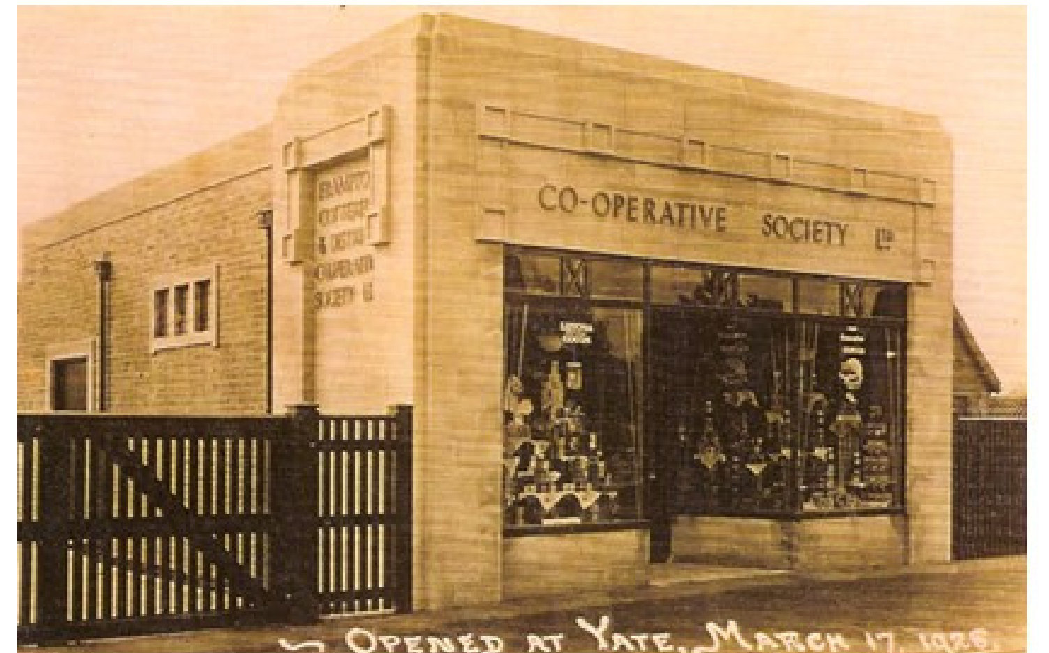
The Co-Op in 1928