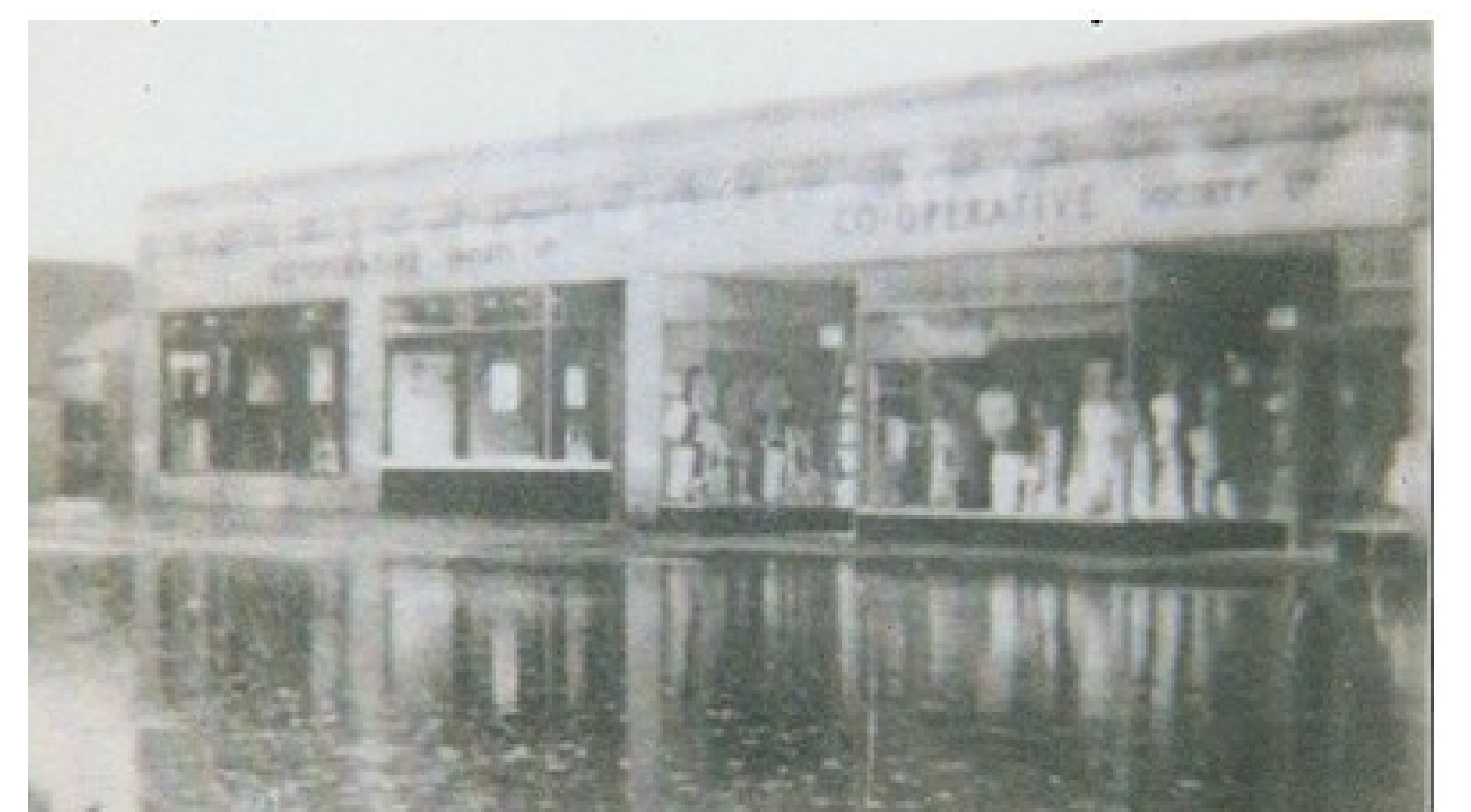
Co-Op shops on a torrential day approx. 1960 (YDOHP)