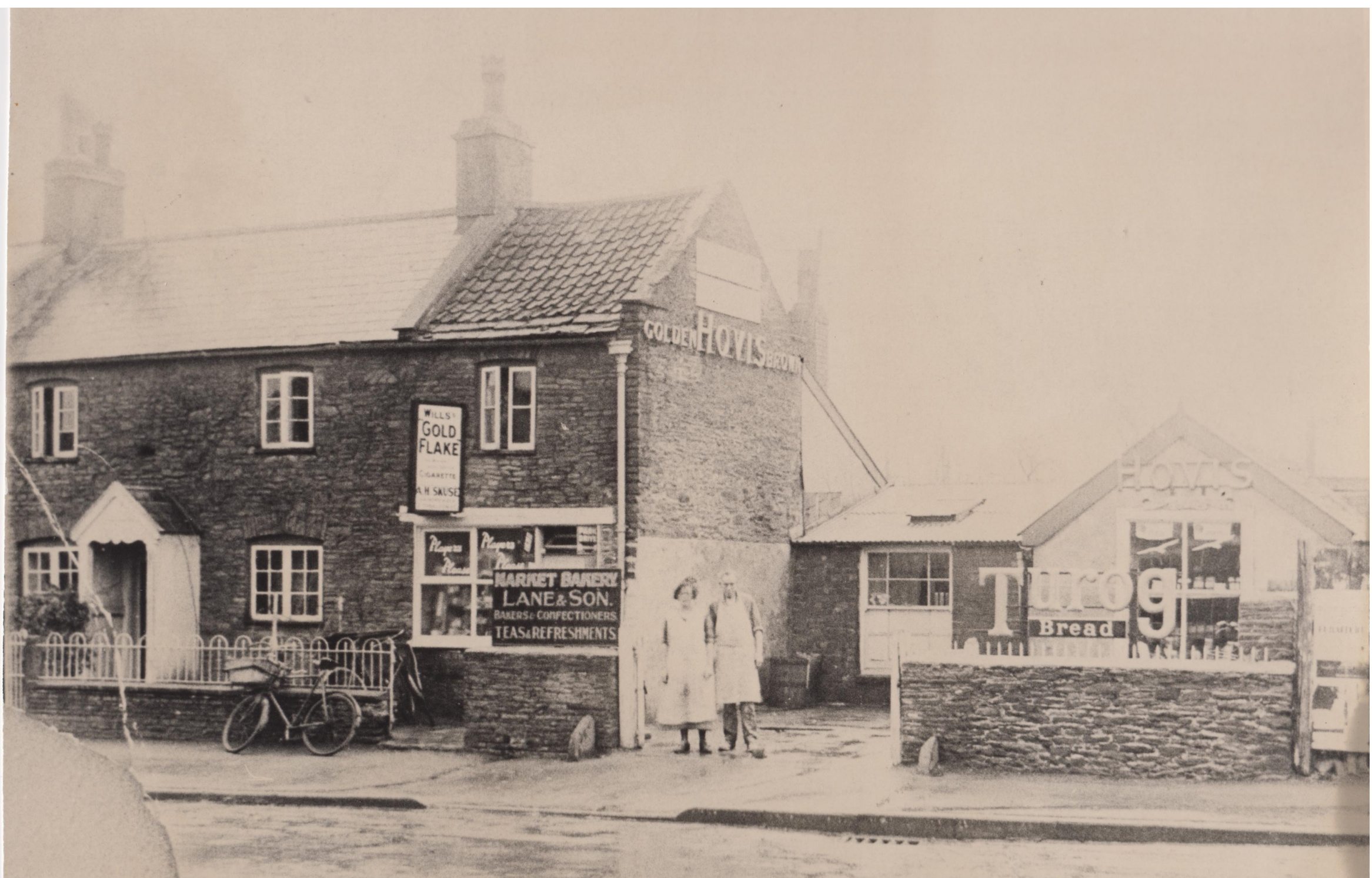
Lane's Bakery c1939

EVOLVING FROM A BAKERY, IT HAS BEEN A CAFÉ FOR MANY YEARS. THE NELSON FAMILY MARRIED INTO THE LANE FAMILY AND HAVE CONTINUED THE BUSINESS AS A CAFE TO THE PRESENT DAY.